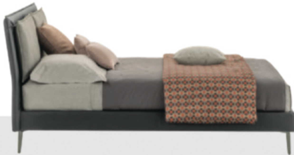
WIKI giroletto/bed frame H 14 cm

Comfort for two. The slightly-curved headboard has two real cushions applied to it that can be customised to match the bed's upholstery for a tone-on-tone look or in a contrasting shade for more original pairings.